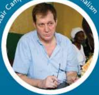
Alastair Campbell - Politics / Journalism

Learning vocab and grammar improves your memory and also boosts your brain power!